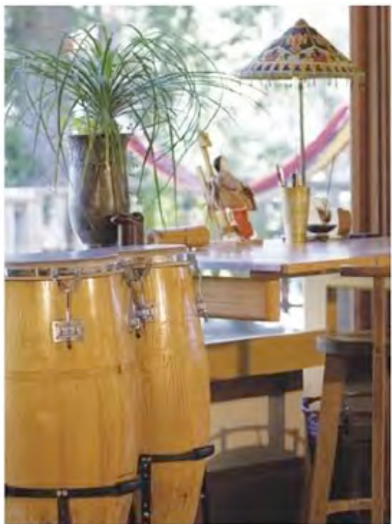
Although the couple has many photographs and paintings they could hang, the walls were kept free to provide negative space. "Alot of it is about the garden," the husband says. "It's so primal to the property. It's living art that we can't compete with."

The property's original garden was created by a Japanese gardener for Golden Gate Park; today, vestiges of his handiwork—a century-old rhododendron, wisteria, and Japanese maple—are incorporated into the new garden plan by Creative Waterways designer Ron Stotts. They happily coexist with lush plantings of azaleas, rhododendrons, ferns, and other lacy-leafed trees and shrubs in a setting that includes a pond-shaped swimming pool, a hidden spa, and a charming teahouse with a sauna inside.